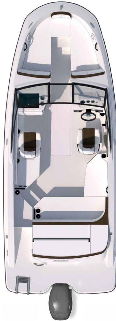
STANDARD PORT BUCKET SEAT