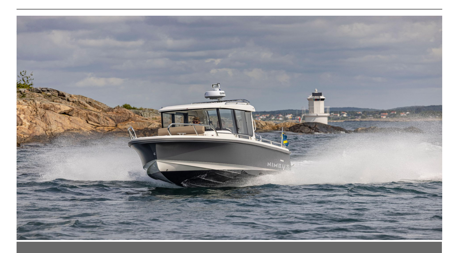
Nimbus C8 OB $311,405

507 Moorhouse Avenue, Waltham, Christchurch